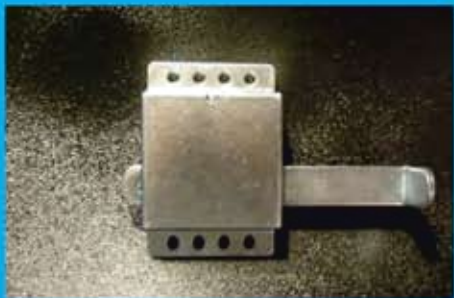
RESIDENTIAL INSIDE SLIDE LOCK