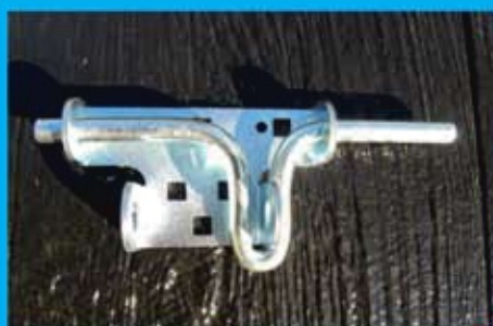
"ONE PIECE" "MINI STORAGE" SLIDE LOCK