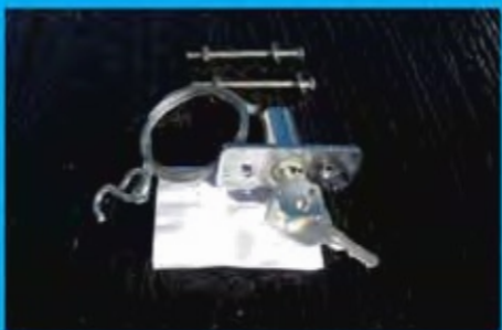
VAULT KEYED EMR CABLE RELEASE 2-KEYS