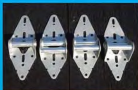
WIDE BODY GALVANIZED 14 GA HEAVY DUTY