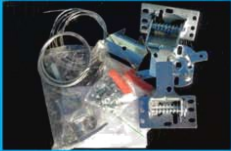
OUTSIDE LOCK KIT W/2 KEYS