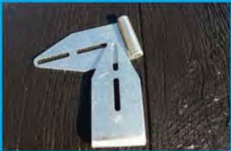
LOW HEAD TOP FIXTURES HEAVY DUTY