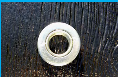
1" BEARINGS PREMIUM ALL STEEL FOR BEARING PLATES OR CENTER SPRING SUPPORT