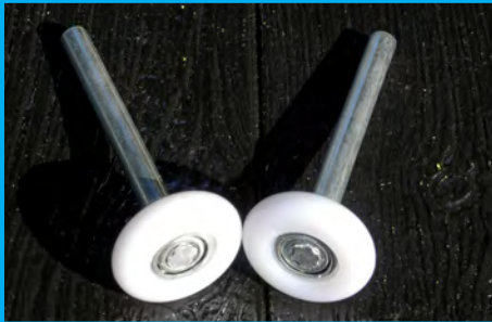
LONG STEM 11 BALL 2" WHITE PREMIUM ROLLER 7" STEM